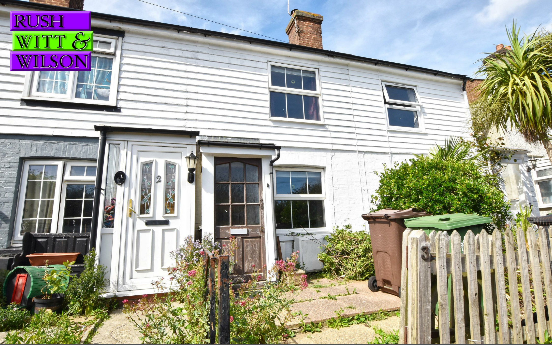
3 Sea View Cottages Main Road, Winchelsea, East Sussex TN36 4BE Guide Price £250,000